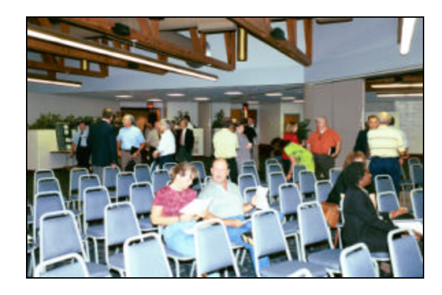
Members of the public arrive at the meeting.