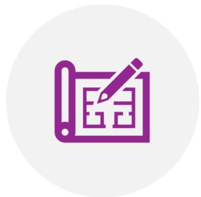
BYPRODUCT MATERIAL FRAMEWORK

On April 13, 2023, the Commission issued SRM-SECY-23-0001 “Options for Licensing and Regulating Fusion Energy Systems” (ML23103A449) directing the staff to implement a byproduct material approach to fusion energy system regulation.