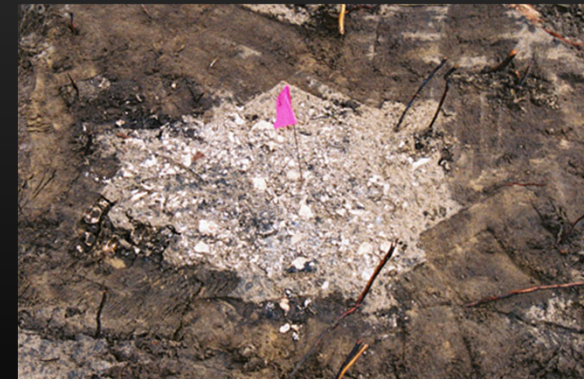
Pile of crushed and burned shells