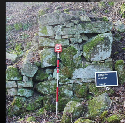
Stone or brick foundations