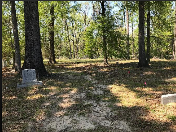
Denley Cemetery Entrance Markers

The only currently known location of human remains on the site is Denley Cemetery. The location of Denley Cemetery in relationship to the CAA can be found on RAS-432-1.