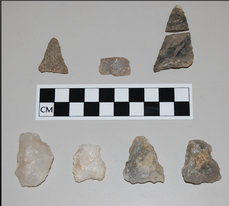
Stone tools like arrowheads, spearpoints, and scrapers