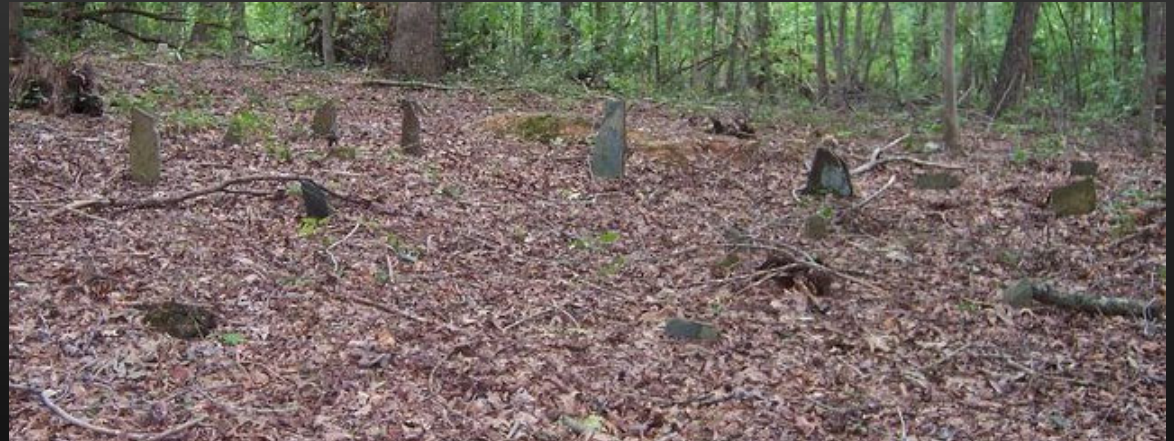
And some are easy to miss