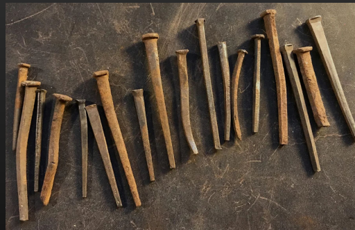
Metal objects like concentrations of rusted nails and cans