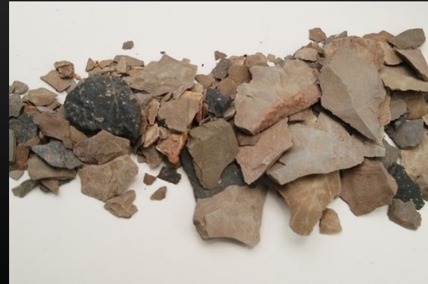
Stone waste flakes from making arrowheads and knives