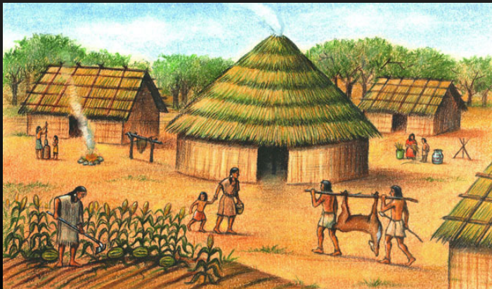
Native American village