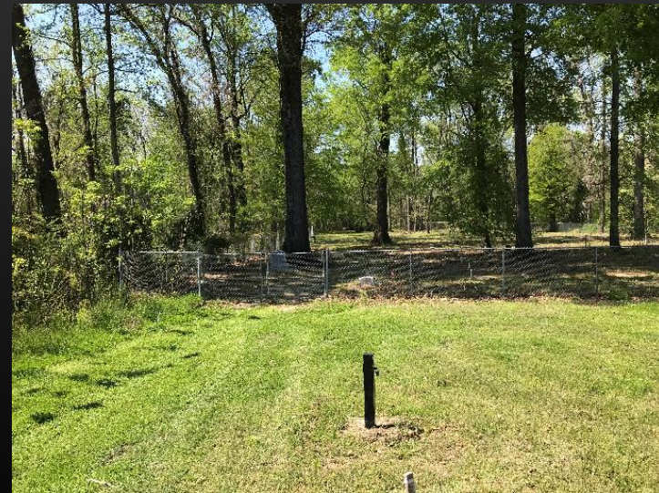
Outside the Denley Cemetery Fence and Entrance