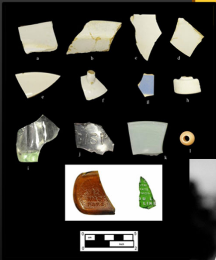
Clusters of ceramic or glass bottles, and jars – or fragments of these