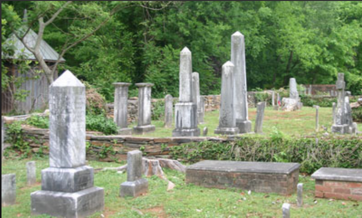
Some of these are well-marked and obvious

We also are concerned with human burials belonging to ALL cultures and time periods.