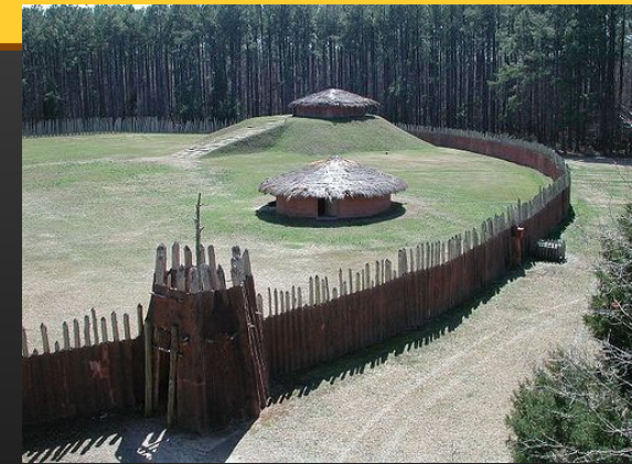
Native American ceremonial mound with stockade