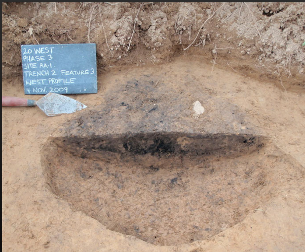
Native fire-pit remnant with charcoal-stained soil