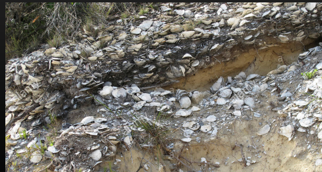
Shell Midden (waste pile of shells and other artifacts)