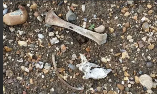
Bones or fragments of bones