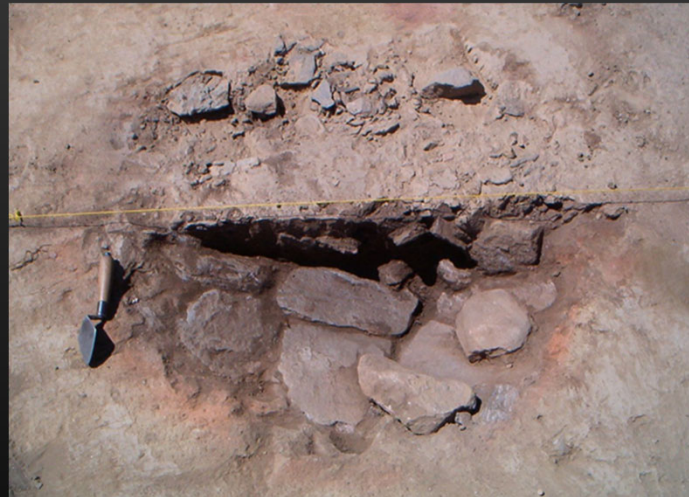
Native fire-pit remnant with burned rocks