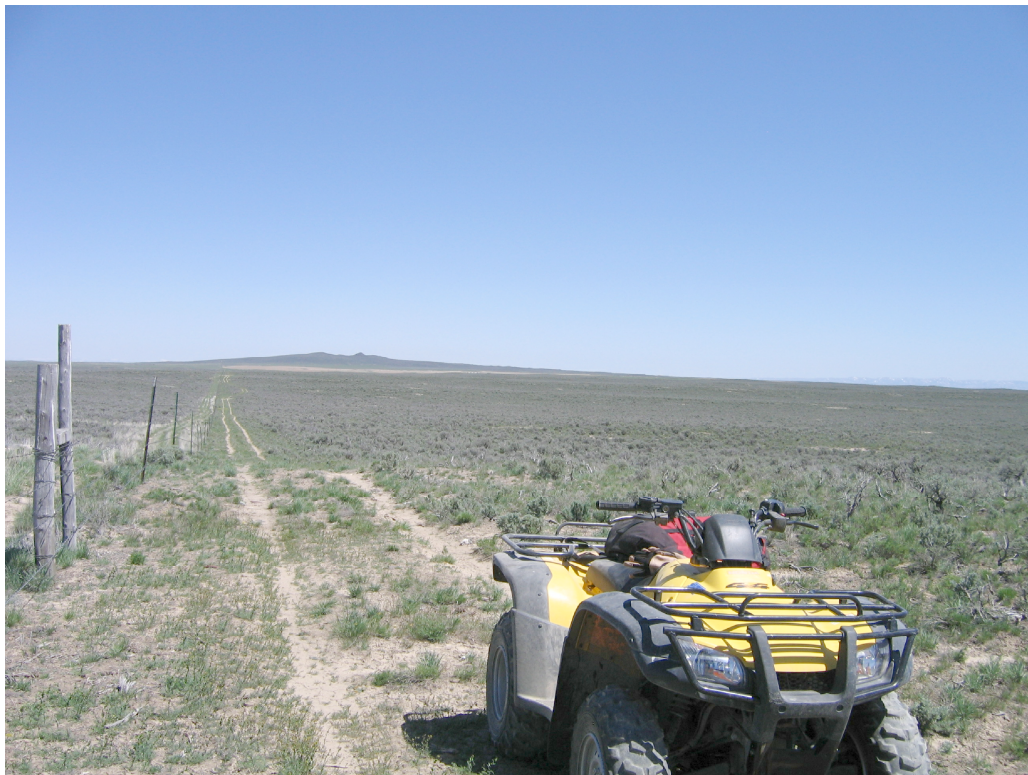
b) KETTLE BUTTE FROM NORTH BOUNDARY FENCE FACING EAST

Figure 3.3-12 Rev. 2 Photos of Significant Geological Features EAGLE ROCK ENRICHMENT FACILITY ENVIRONMENTAL REPORT