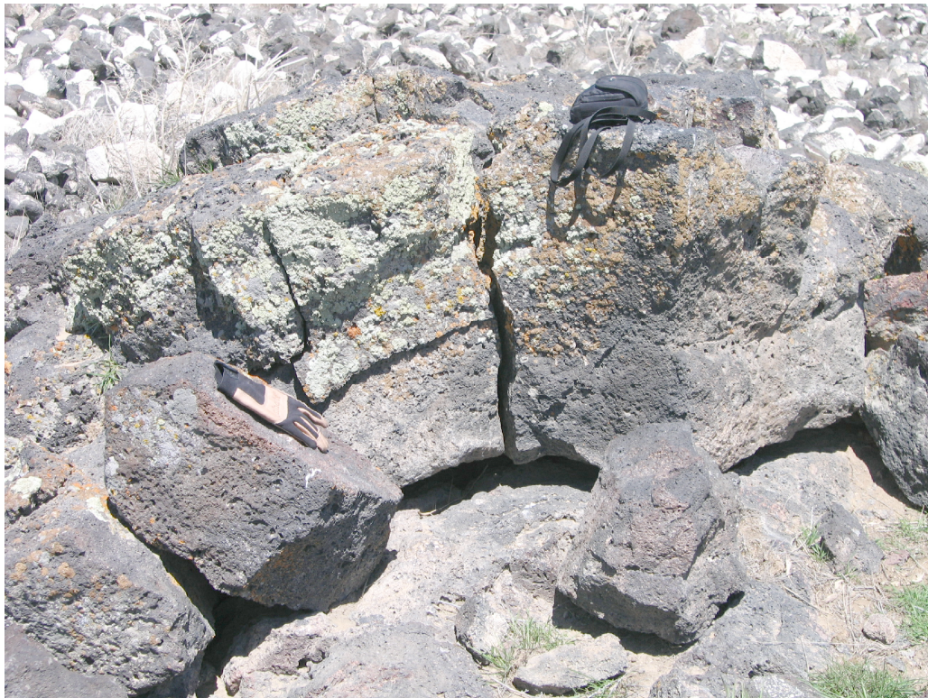
a) HORIZONTAL JOINTING AND CAVITIES