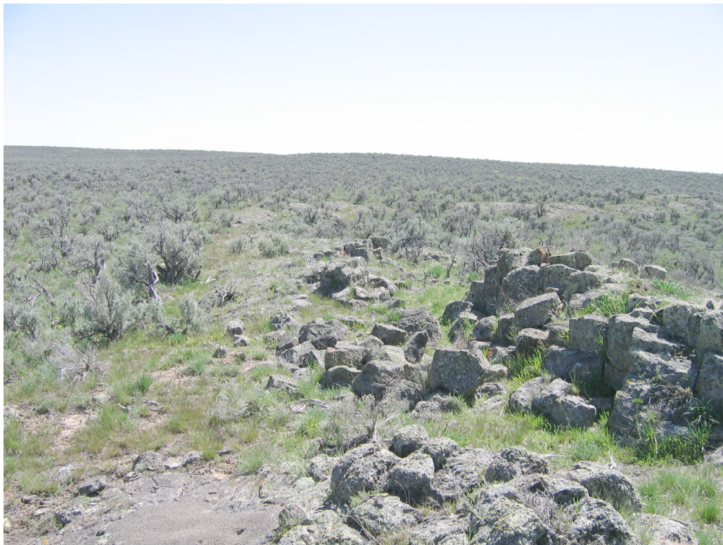
b) TOE RUBBLE AT END OF FLOW