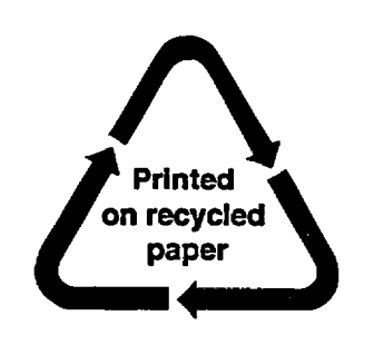
Federal Recycling Program