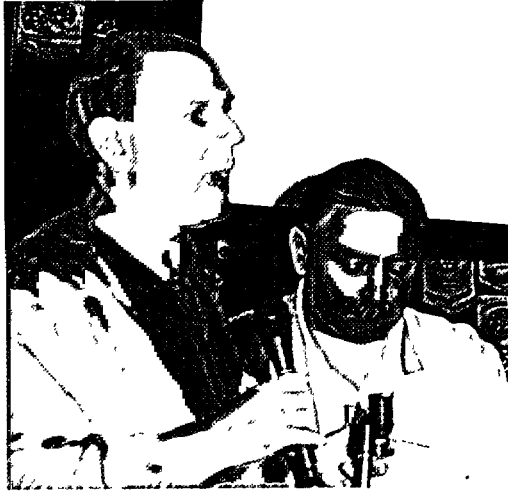
Category 1 meetings are typically held with one licensee and are open to public observation.

As a result of the September 11, 2001 terrorist attacks, attendees at NRC meetings will experience enhanced security procedures. Areas affected include NRC visitor registration, badging, sign-in procedures, and parking. These procedures and certain restrictions on cell phone, taping equipment and camera usage are described later in this brochure.