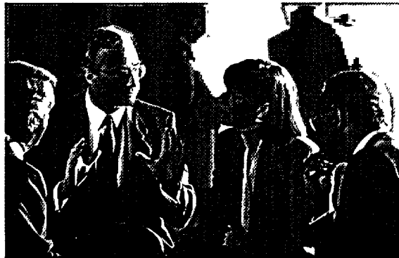
Category 2 meetings provide an opportunity for the public to provide NRC with feedback on the analysis of issues, alternatives, and/or decisions.

Meetings in this category are typically held with a group of industry representatives, licensees, vendors, or non-governmental organizations, such as public interest and citizen groups, to focus discussions on issues that could apply to several facilities. Examples of such issues are plant system aging, license renewal, decommissioning, and spent fuel storage. These meetings provide an opportunity for the public to not only observe and obtain factual information, but to also participate by providing NRC with feedback on issues, alternatives, and/or decisions.