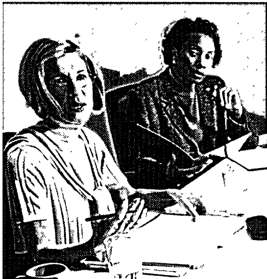
Category 3 meetings fully engage the public in discussions.

of meeting is to work with the NRC and to provide a range of views, information, concerns and