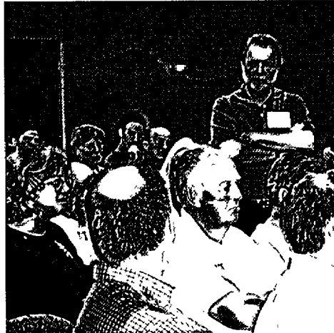
The Nuclear Regulatory Commission has long recognized the importance and value of public involvement in its activities.

three categories of staff meetings and outlines the level of public participation, information availability, and follow-up effort associated with each category.