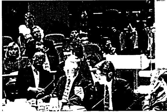
Whenever practicable, NRC will make a reasonable effort to provide teleconferencing access for meetings which are not easily accessible to interested citizens.

Follow-up and feedback at these types of meeting is similar to that in Category 2 meetings, but meeting summaries or transcripts will be provided in ADAMS and linked to the NRC web site.