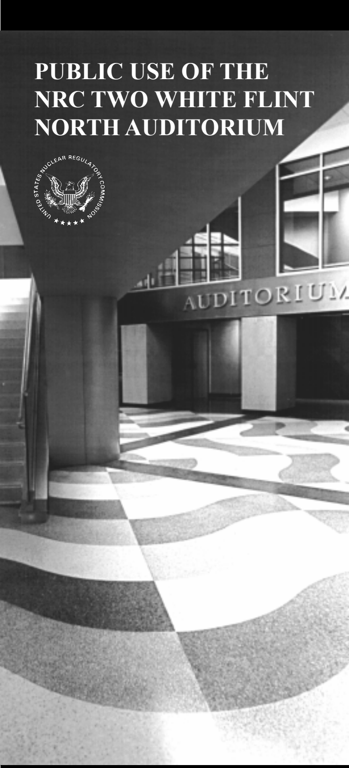
U.S. Nuclear Regulatory Commission