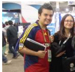
Fellows at the exhibitor floor.