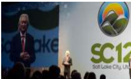
Keynote speaker Dr. Michio Kaku