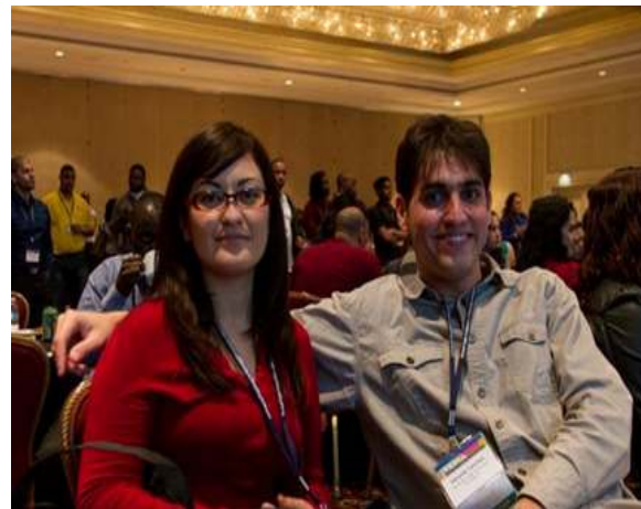
Fellow D at the Conference

In the near future, our Fellows are scheduled to attend the following conferences: